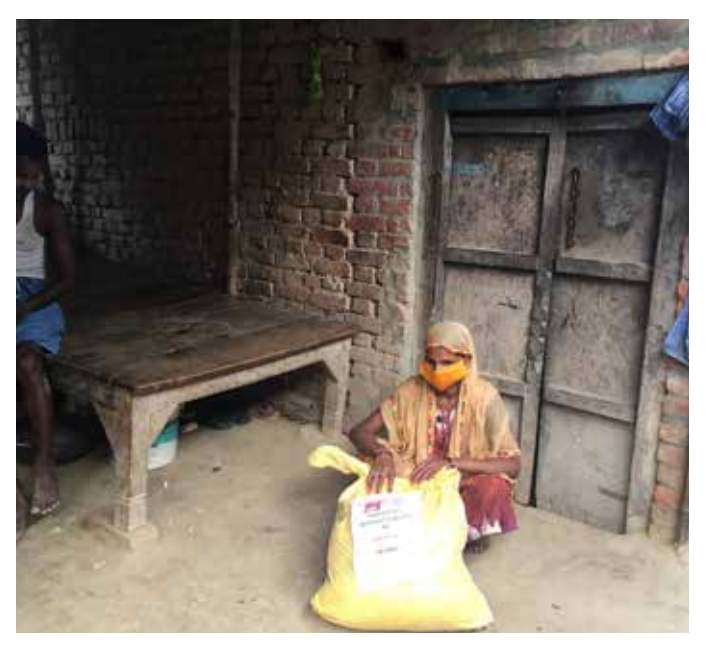
A beneficiary who is a blind mother receives a food kit in Tikaria Village, Azamgarh.

o crisis will keep us from our mission to empower the underserved. As we continue our COVID-19 disaster relief efforts, we are continuing to partner with U.S. organizations and NGOs in India (such as those listed below, among others) to provide urgent aid to those in need.